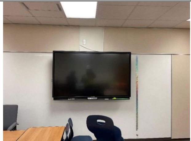
Item #04: Progress view of promethean board installation in Area FF.