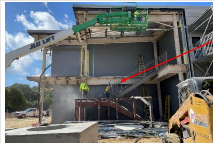
Item #03: Progress view of interior stair demolition in Area E.