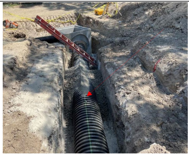
Item #02: Progress view of ongoing underground storm line installation.