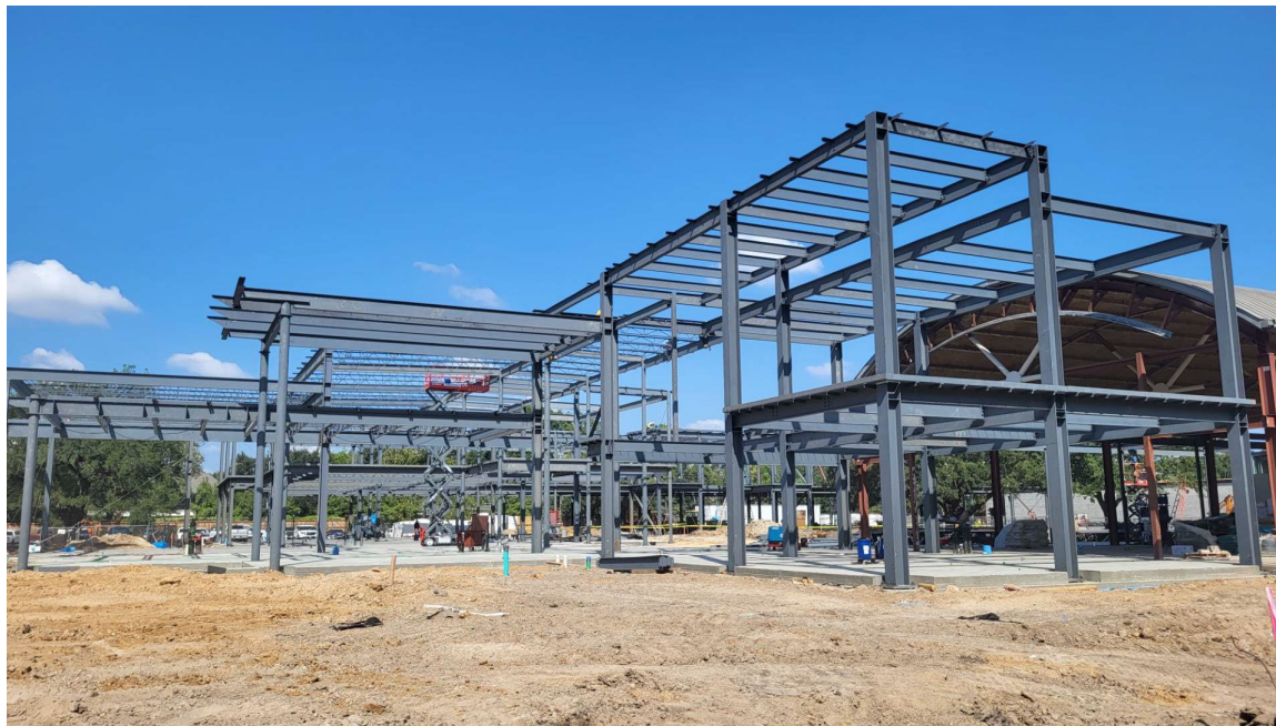
Area B Steel