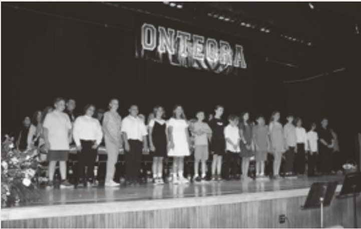
Members of Bennett’s Class of 2023 are applauded at the Harry Simon Auditorium during their June moving-up event.