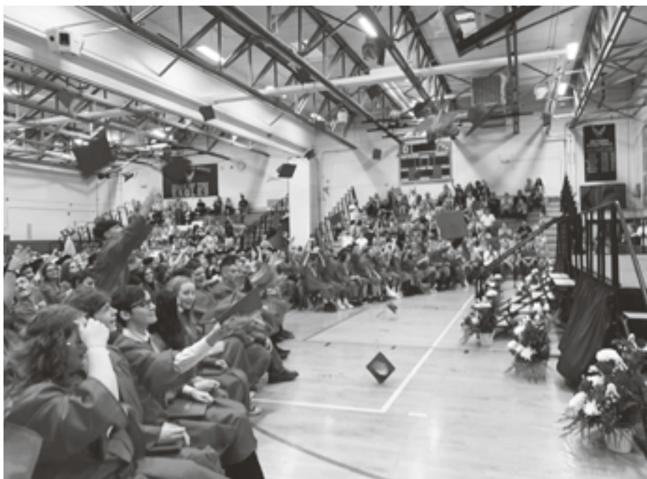
Members of the Class of 2023 make their graduation official by following the tradition of throwing their caps at the conclusion of their commencement ceremony.