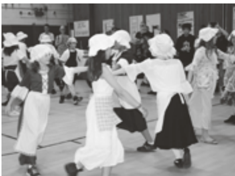
Grade 4 students at Bennett participated in fun and festive dances at a Colonial Fair, held this past June.

At the fair’s conclusion, students showed off Colonial dances they had learned in their physical education classes, while student and teacher musicians performed the much-loved American favorite, “Yankee Doodle.”