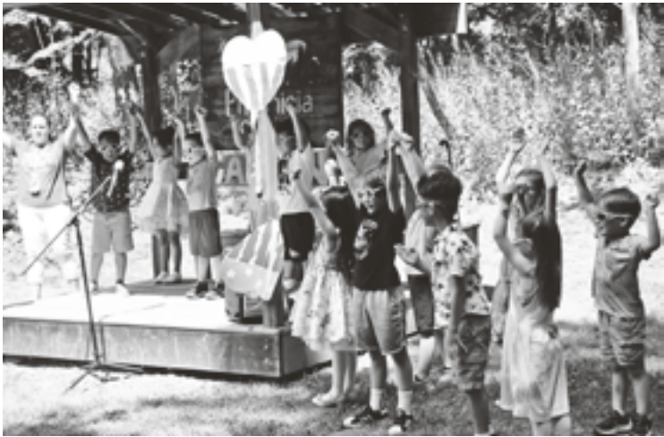
Eagles take the stage in the garden at Phoenicia Elementary School on June 2nd to officially complete Kindergarten.

Afterwards, the students enjoyed a PTA-sponsored picnic with their families. What a great way to celebrate this milestone!