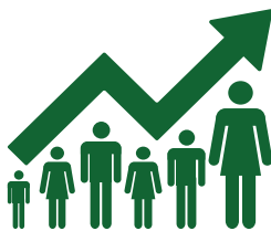
LAND PURCHASE FOR FUTURE EXPANSION