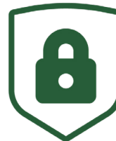
SAFETY & SECURITY UPGRADES

VOTE EARLY OCT. 23 - NOV. 3 | ELECTION DAY TUESDAY, NOV. 7