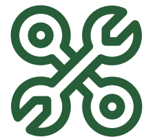
CRITICAL CAPITAL IMPROVEMENT PROJECTS