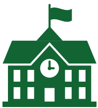
NEW 5 th / 6 th GRADE INTERMEDIATE CAMPUS