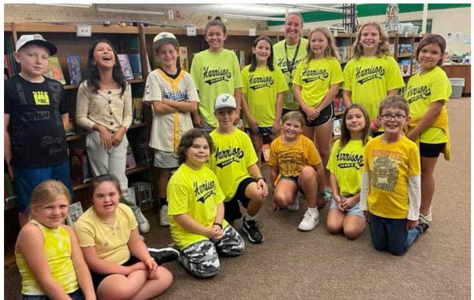
Color War Day