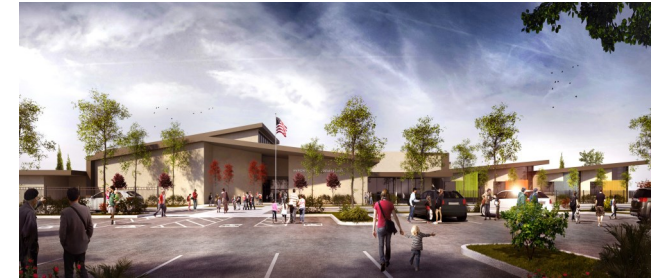
Mangini Ranch Elementary School