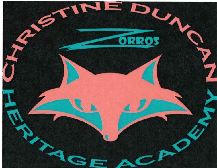
SCHOOL SPIRIT SHIRT LOGO