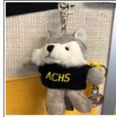
Wolfie key Chain