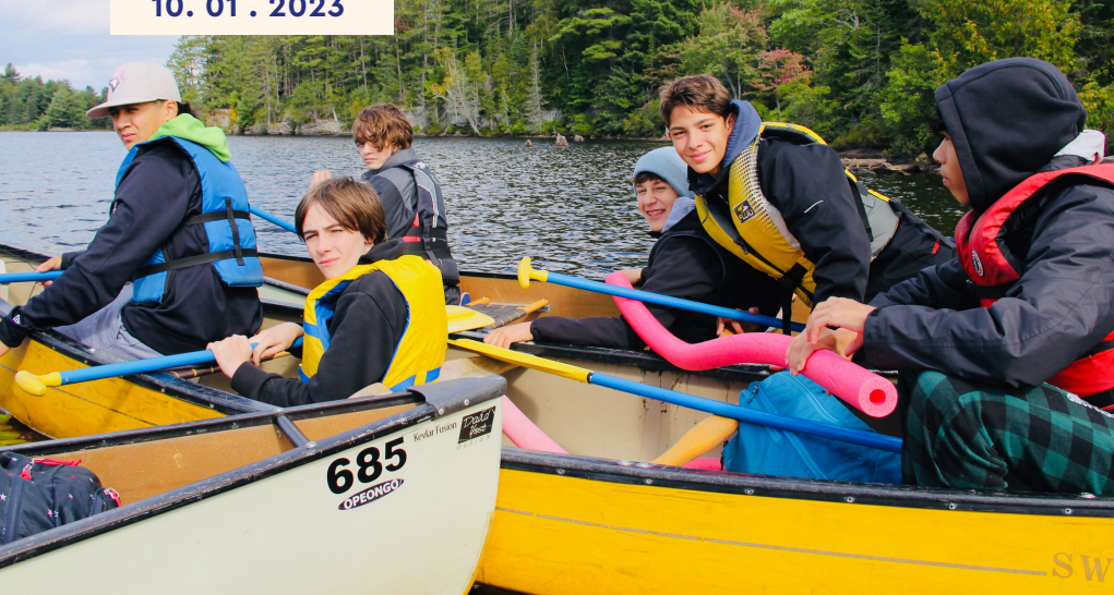
Senior School students canoeing at Camp Arowhon.

Year 3 began with more students, more grades, more staff, and a great start to enriched experiential learning. Enjoy these updates since our May Stories from the Journey .