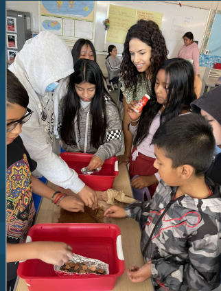
International Baccalaureate (IB) Program at Oak Grove MS