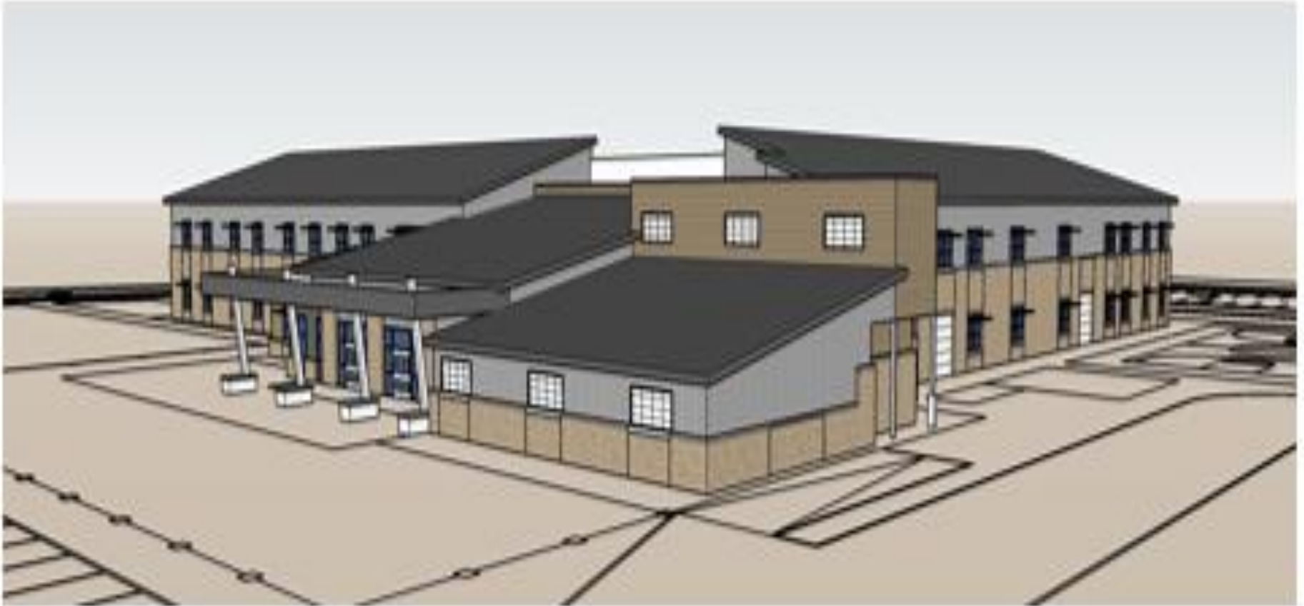
North side of building