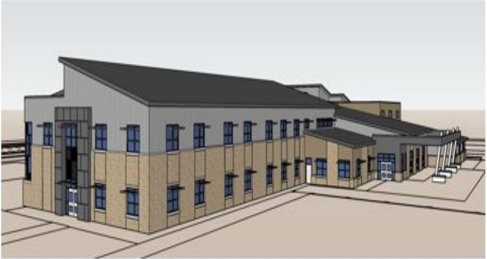
East side of building