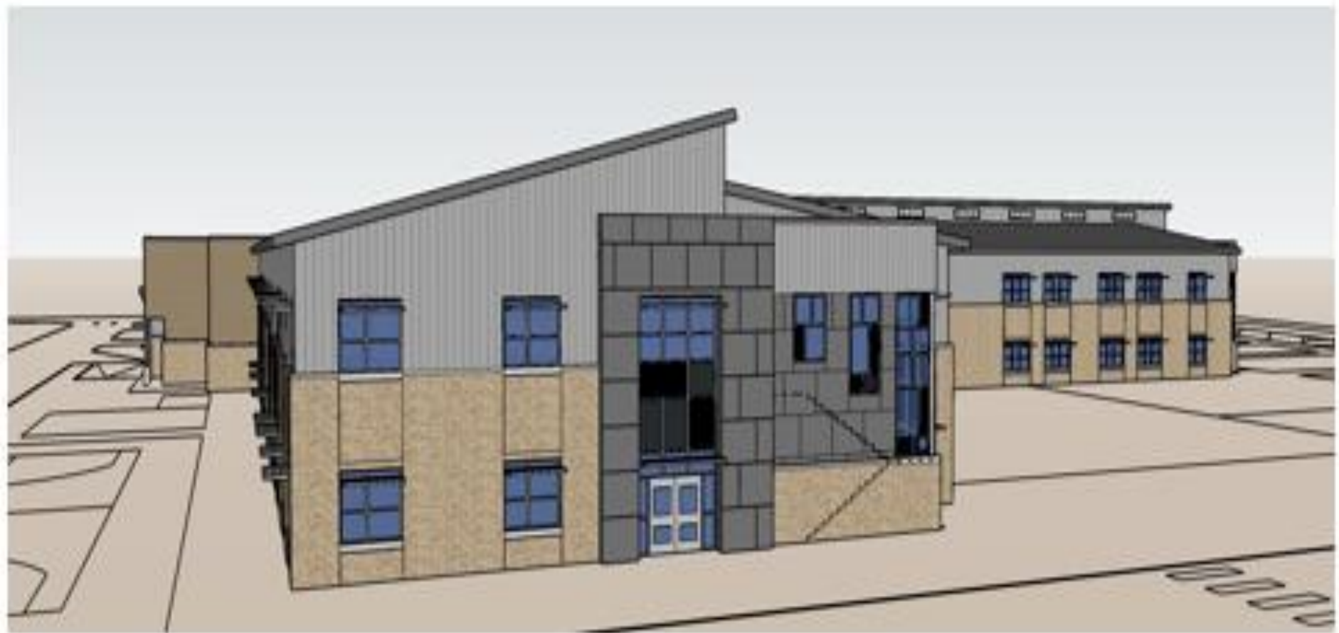
West side of building