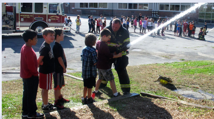
Members of the Montrose Fire Department demonstrate how to use a fire hose to FGL students.