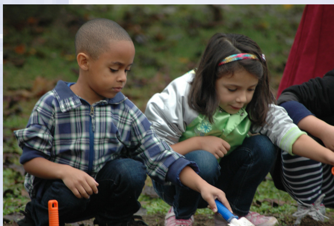
FGL Students take part in the annual bulb planting. Can't wait to see their efforts pay off this spring!

For specifics, please follow my blog at Curriculum Showcase for details: http://www.henhudschools.org/blog.cfm?blogID=4306