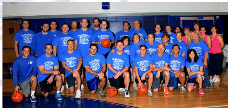
Members of the Hen Hud faculty, staff, and administration joined forces with Hen Hud Free Library staff and Hen Hud Athletic Hall of Fame members to take on the Harlem Wizards.

The Hendrick Hudson Community Educational Foundation, Inc. is a community-based 501(c)(3) non-profit organization, existing for the purposes of raising and granting funds in support of educational activities to benefit the citizens residing within the boundaries of the Hendrick Hudson School District. The HHCEF does not receive financial support from the school district. To learn more about the HHCEF, visit www.HHCEF.org .