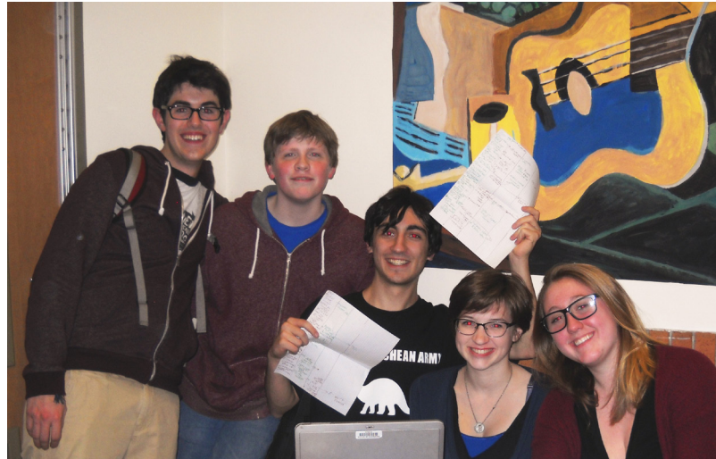
Hen Hud students outside the tabulation room taking and entering ballots for the Malcolm A. Bump Debate Tournament.

Over two days, nearly 300 debaters and more than 100 judges participated in the compe-