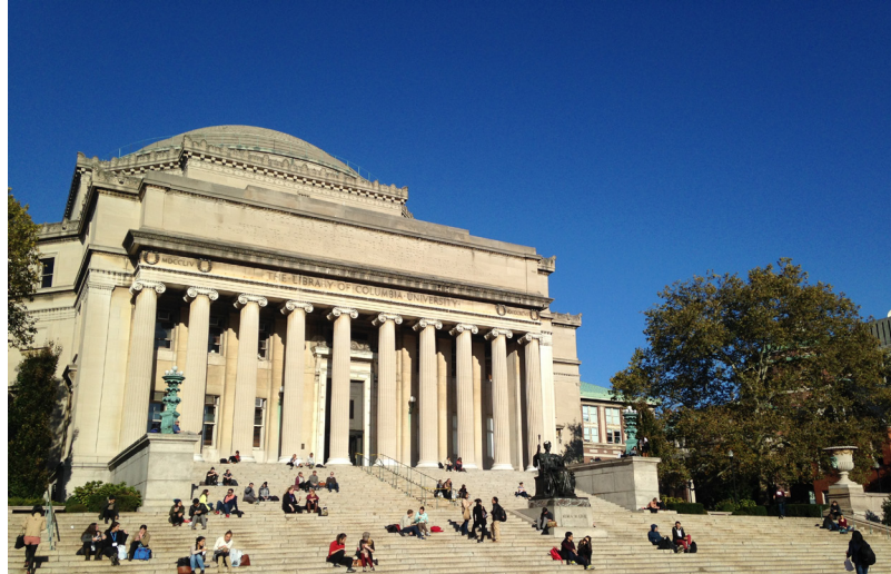
Columbia Scholastic Press Conference attendees take a break outside on a sunny November day.

Then there was a lecture by Fordham Law School alumnus Adam Goldstein called