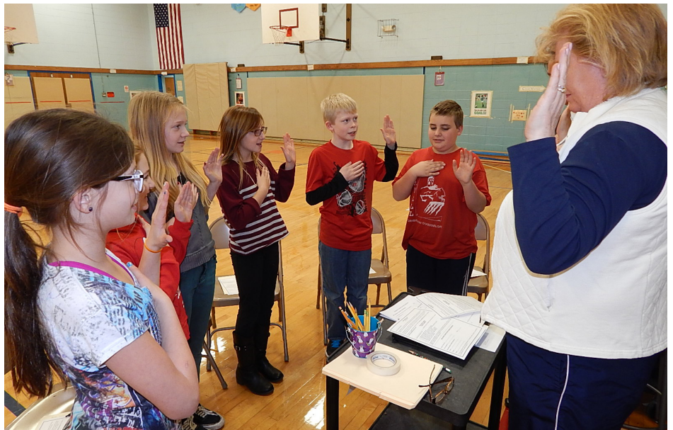
Furnace Woods School Student Council Members take their Oath of Office.

Twelve fifth-grade students (four from each homeroom) participate in the B-V Student