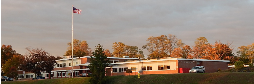
The American flag flies proudly at sunset over the Frank G. Lindsey Elementary School

On Tuesday, May 19, 2015, residents of the Hendrick Hudson School District will go to the polls to vote on a $74,407,339 spending plan for 2015-16. For the third consecutive year, Hendrick Hudson's budget represents one of the lowest tax levy increases (0.03%) in Westchester County.