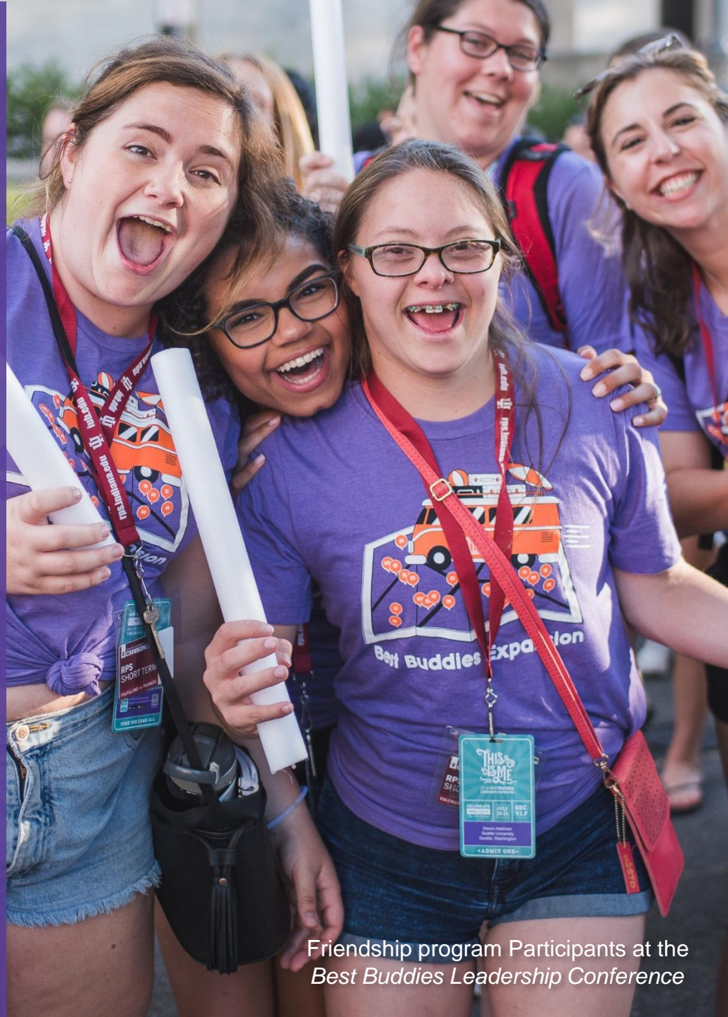
Friendship program Participants at the Best Buddies Leadership Conference

Empowering people with disabilities by helping them form meaningful friendships with their peers, secure rewarding jobs, live independently, and feel valued by society .