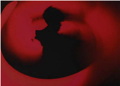
Otto A., Class of 2026