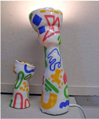
Sydney T., Class of 2024