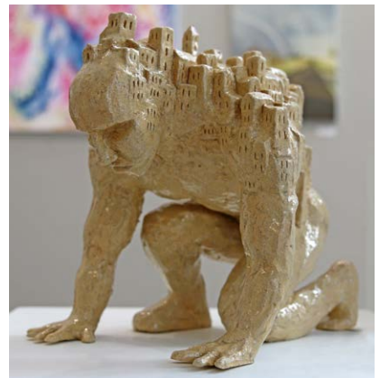
Ben S., Class of 2024