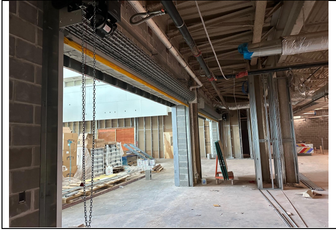
OH Doors Kitchen & E Commons