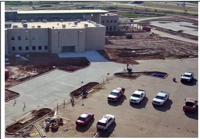
Area A Parking/ Drive Pour

WICHITA FALLS MEMORIAL HIGH SCHOOL August 11, 2023