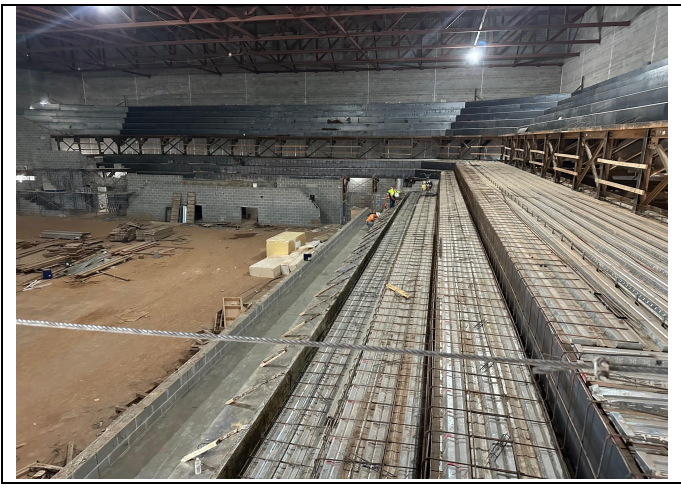
Competition Gym Tread & Riser Pour Prep