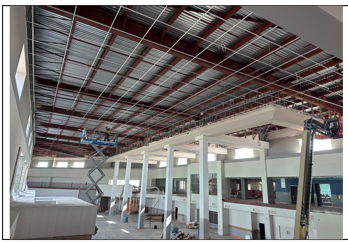
Area T Ceiling Grid, Texture