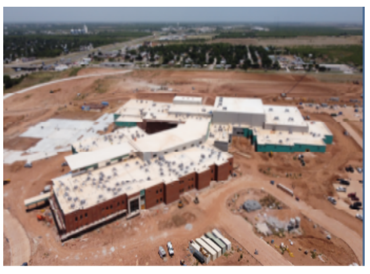
Partial Site Aerial