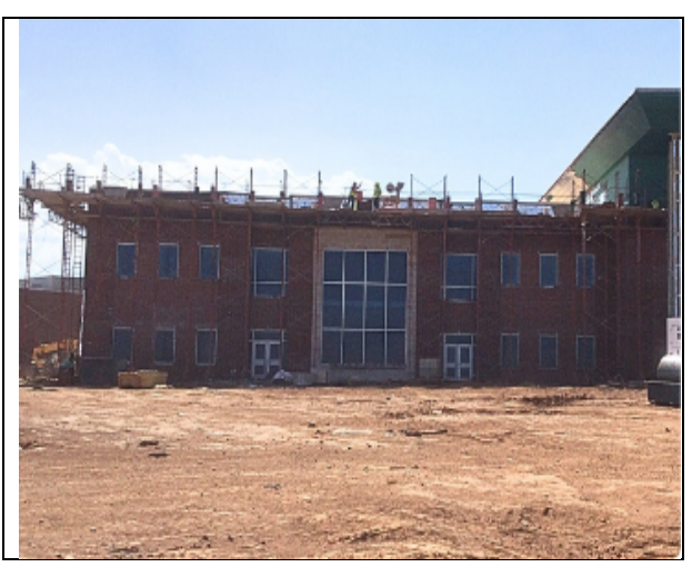
Area A brick veneer