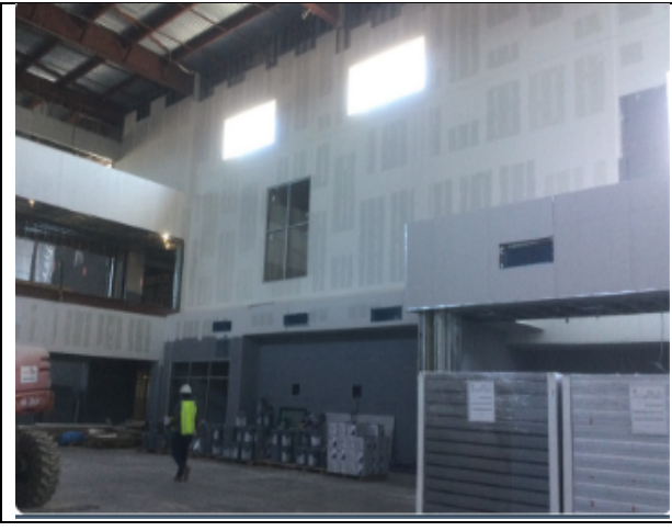
Wall texture tape and bed Area E