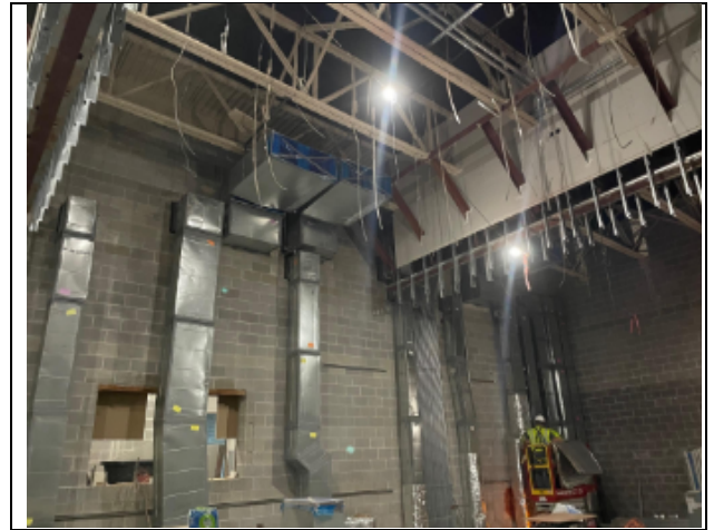
Auditorium overhead work