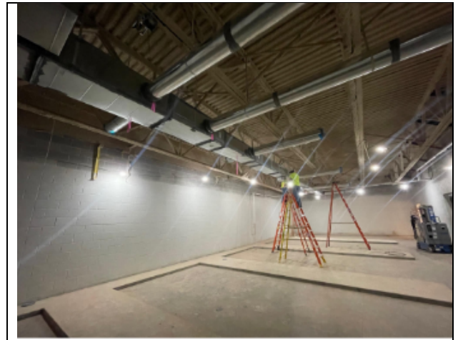
Locker rooms overhead rough-in work