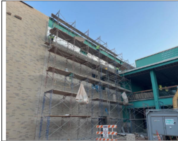
Courtyard brick veneer