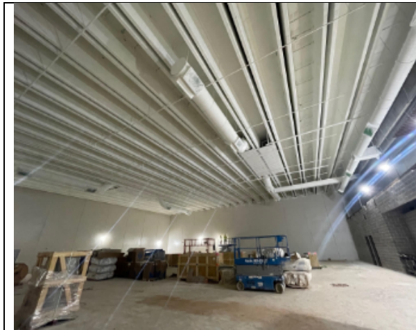
Auxiliary Gym Painting