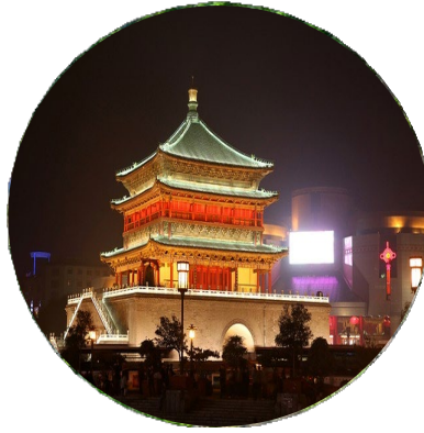
Xi'an Bell Tower