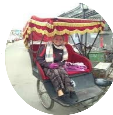
Rickshaw ride in Hutongs