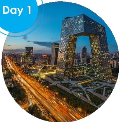
Arrive in Beijing, China