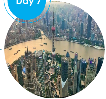
The Bund & Huangpu River