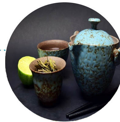
Antique Market & Tea ceremony