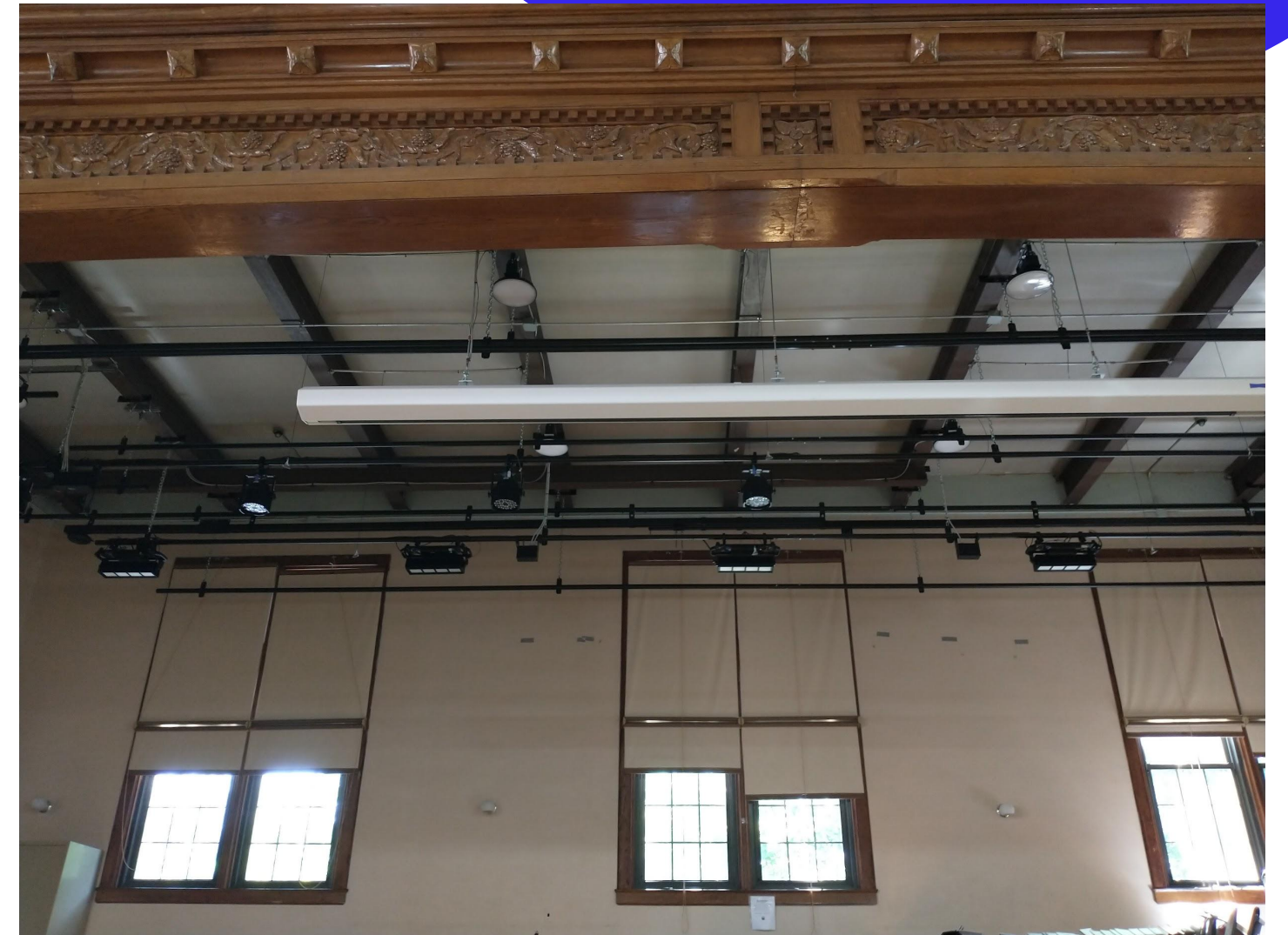
Lighting in Briarcliff Multipurpose Room