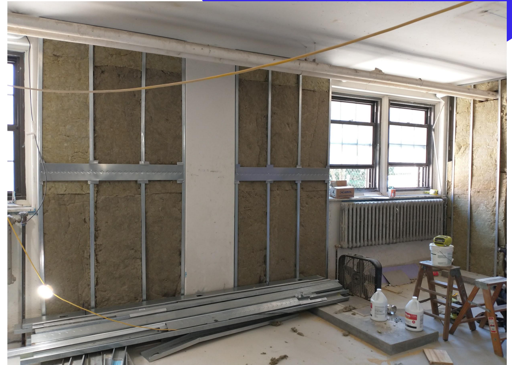
Briarcliff Locker Rooms