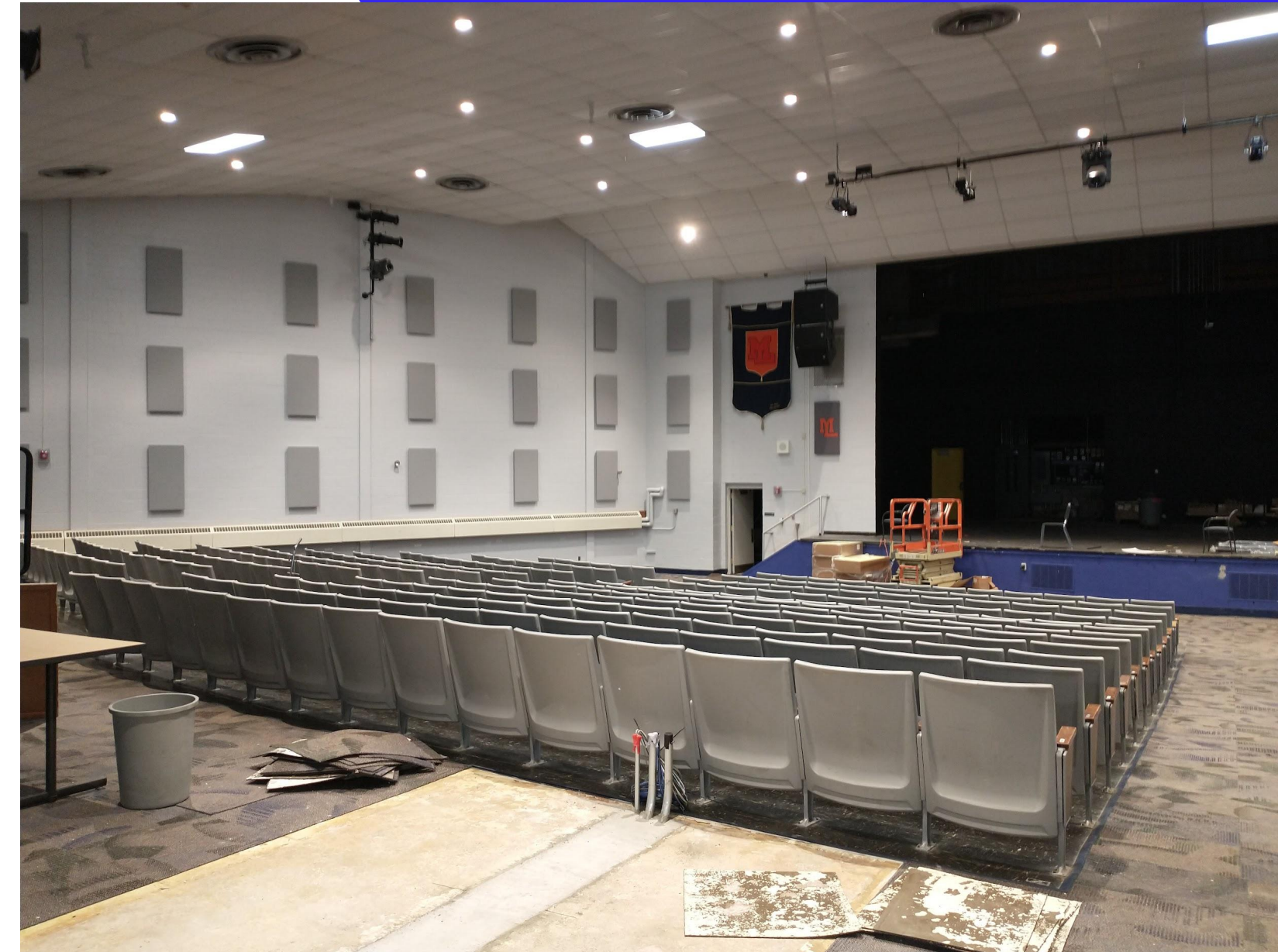
New Paint & Acoustic Panels