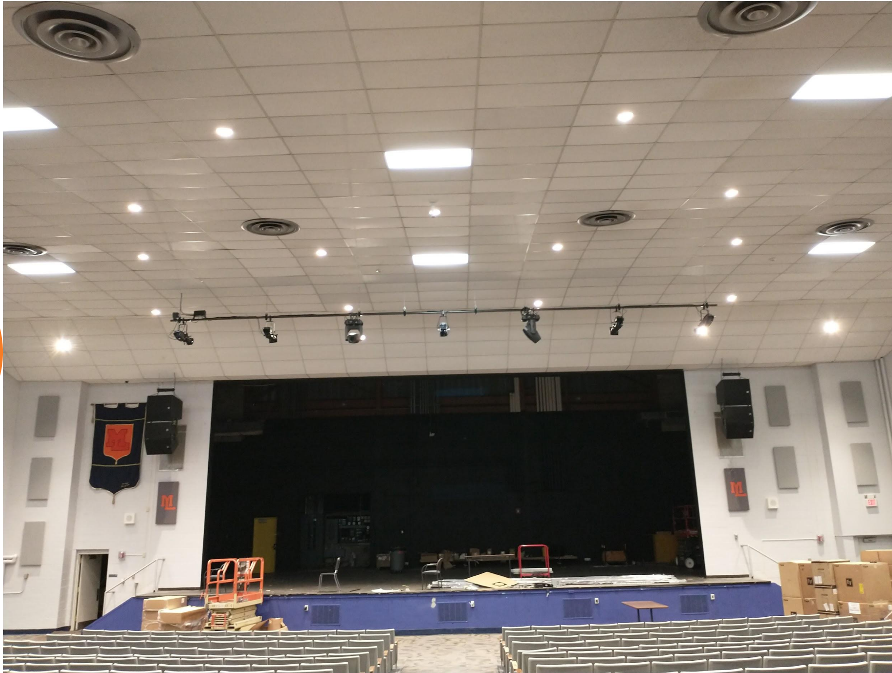
MLHS Auditorium Lighting & Sound Upgrades