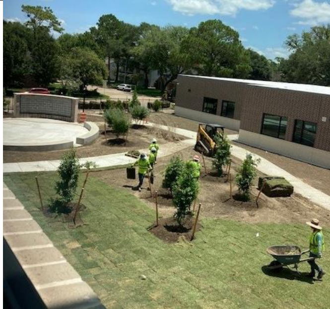
View of grass installation at outdoor presentation wall.