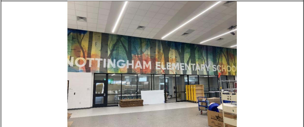
View of graphic in cafeteria.