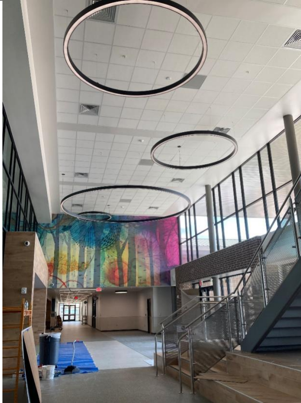
View of graphic in front of Library.