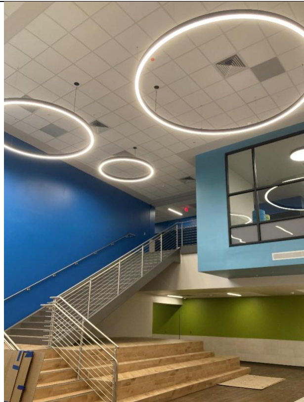
View at entrance closest to the Bus Loop.