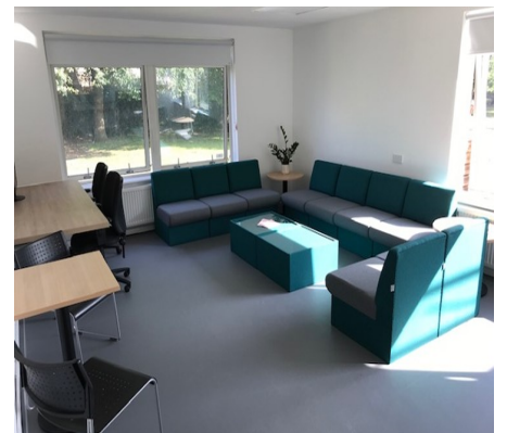
Photo: Refurbished staff room

We will be changing some aspects of communication this term. We will no longer be using the class email addresses. Instead, all communication will go through the school office email – office@woodlandsparkschool.org The office will then pass your communication on to the relevant member(s) of staff. We hope this will reduce teachers needing to monitor multiple email accounts and mean that we can be more responsive.