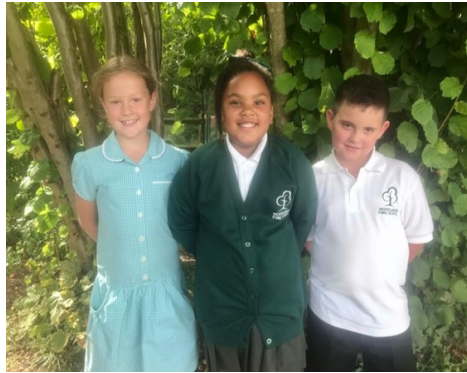
Photo: Pupils modelling our new uniform

break wearing the new uniform, and looking very smart we might add! We are hoping the uniform ties in more with our Woodlands theme and the children feel proud to wear it.