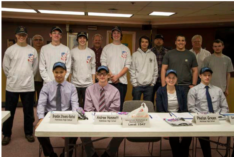
MAY 5, 2016 SIGNING CEREMONY

The School to Apprenticeship application packet may be found on the FNSBSD website at: HTTP://WWW.K12NORTHSTAR.ORG/PAGE/2563