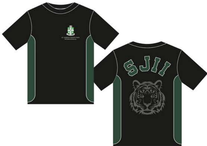
SHORT SLEEVED T-SHIRT

As a reminder, all non compulsory sports attire should only be used for training sessions and sports fixtures , or for recreational wear outside school hours .