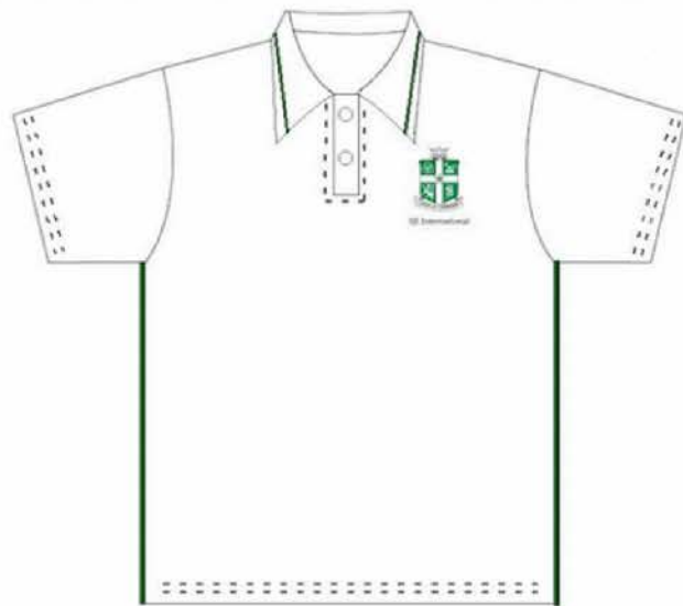
PE POLO SHIRT

Students may wear PE Kits to school but must change into day uniform after lessons for hygiene reasons (unless PE is the last lesson of the day).