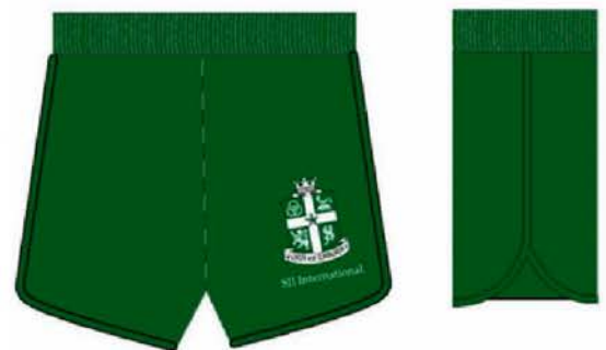
GIRLS' PE SHORT (with inner short)