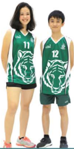
VOLLEYBALL & TOUCH RUGBY