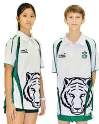
BADMINTON & TENNIS