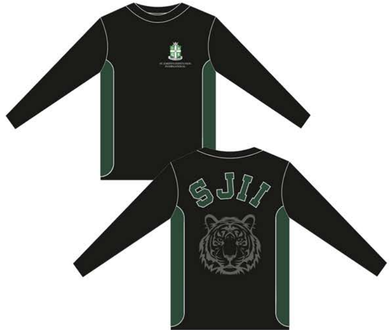
LONG SLEEVED SPORT SHIRT