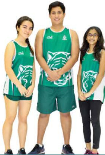
CROSS COUNTRY / TRACK & FIELD