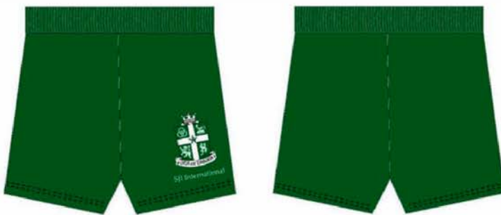
BOYS' PE SHORT