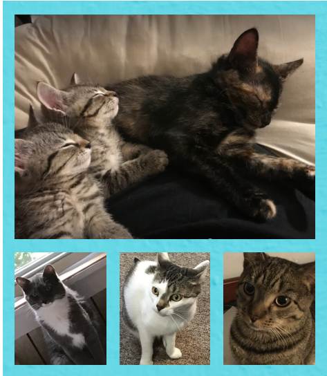
Peaches, Rocket, Nova, Smokey, Lilly and Manny