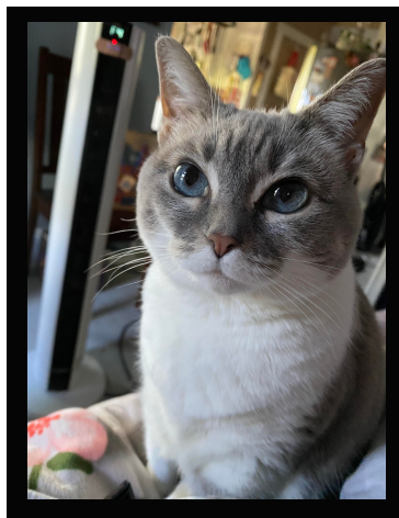
Kat Gallagher's kitty.