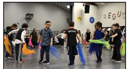
Steindorf 2nd graders performed a colorful butterfly dance at the annual music concert.