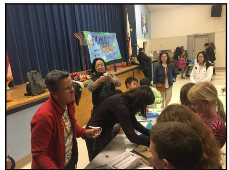
Sartorette's students participated in a "magic" science night, enjoyed by many families.

Sartorette Elementary students participated in free family Science Nights and the events were very successful. The theme was "Magic" and the scientists-in-training participated in various activities that looked like magic, but were in fact science. Families has a great time! The event took place over two nights, one for grades 3 -5 and the other for TK-grade 2. Way to go, Sartorette!