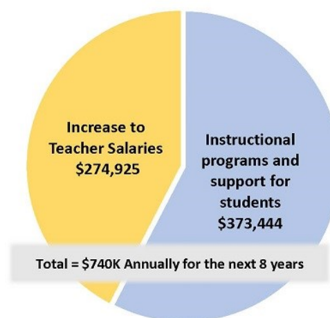
Measure H: Parcel Tax Fund Allocations

Cambrian School District greatly appreciates the community support that successfully passed Measure H last June 2018 and supports teacher salaries and our instructional programs.