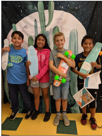
Fammatre students created cereal commercials based on skateboarder Tony Hawk.