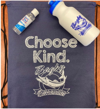
Bagby's Home & School Club provided welcome back gifts.