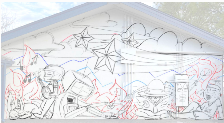
Sartorette's new mural should be complete, with student input, by the end of the school year.