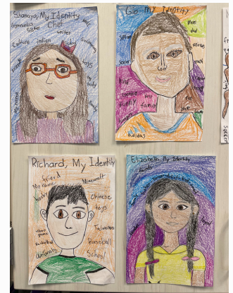
Steindorf 3rd graders reflect on names & who they are as individuals.