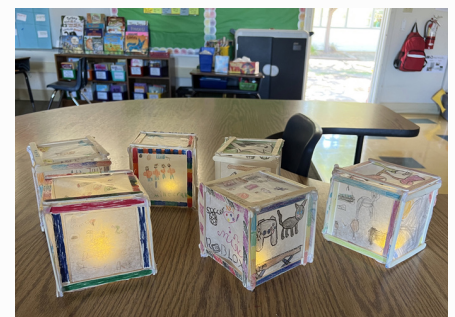
Fammatre's 3rd graders created compelling identity lanterns.

After the group piece was done, students put together the lanterns and used battery tea lights to light them up. Great job, Fammatre students!