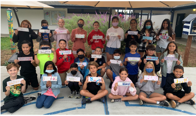
Farnham Elementary School 5th graders showed My Name, My Identity projects they created.