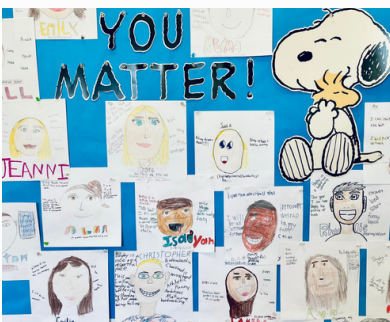
Bagby students created detailed self-portraits, complete with adjectives describing themselves, as part of the My Name, My Identity initiative.

Great job, Sartorette staff and students, for building an inclusive and respectful culture on campus!