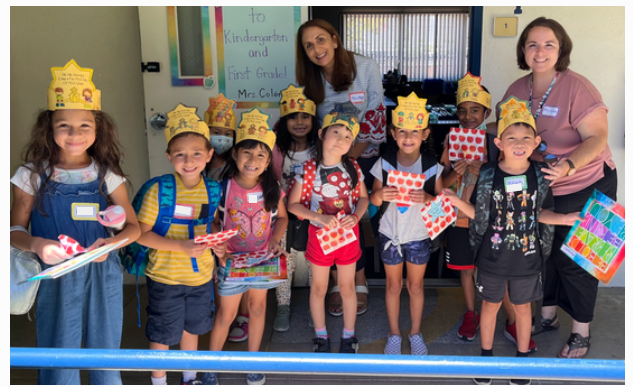
Sartorette Elementary School students learned each person's name and how to correctly pronounce it.

This was one of several activities surrounding the initiative, designed to foster and promote global awareness of the importance of honoring students' diverse cultures and languages.