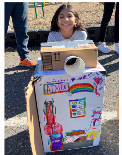
Fammatre student displays cardboard creations on Cardboard Day.

Students worked in small groups to create anything they wanted with cardboard (forts, games, mazes, masks etc). The sky was the limit!