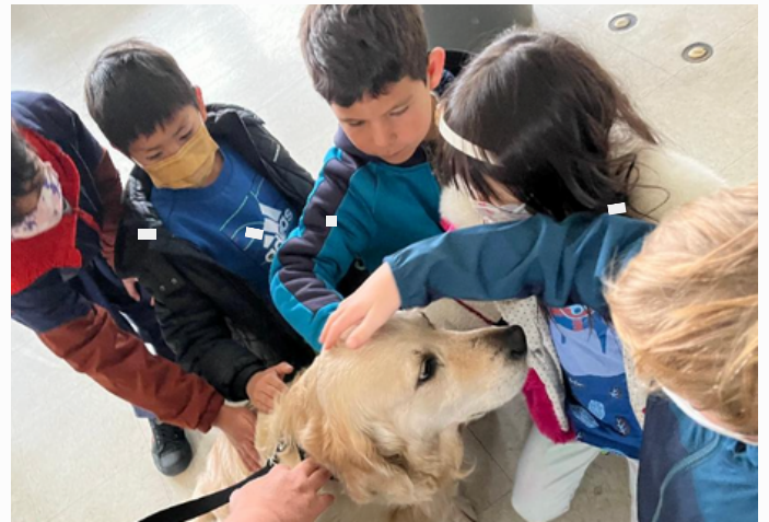
Sartorette Elementary School students engage in productive activities at the school's Wellness Center.

Following the Science Fair, the school hosted a Community Science Night, where families participated in hands-on activities and experiments. This event provided an interactive opportunity for families to engage in scientific exploration and to see their children's work firsthand.