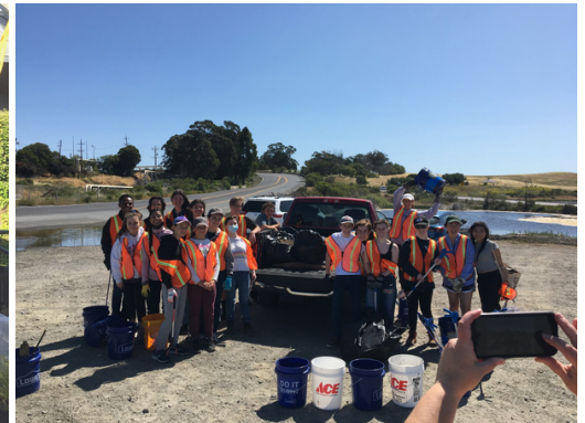
The Club Meets on Tuesdays @ lunch in the Theatre (DLS)