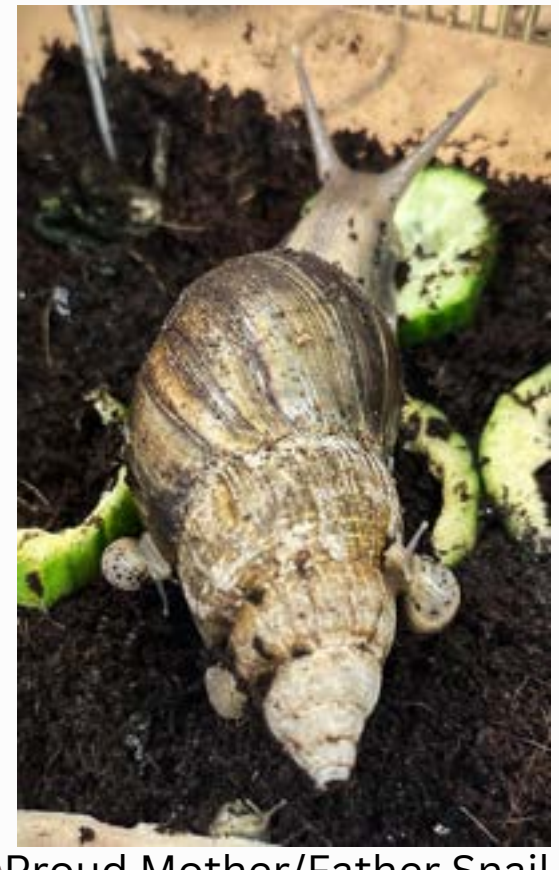
Proud Mother/Father Snail