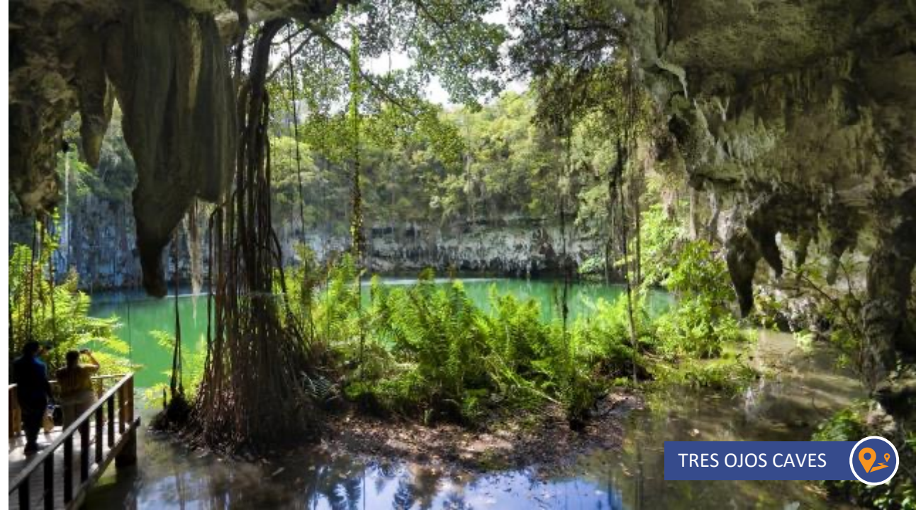
TRES OJOS CAVES