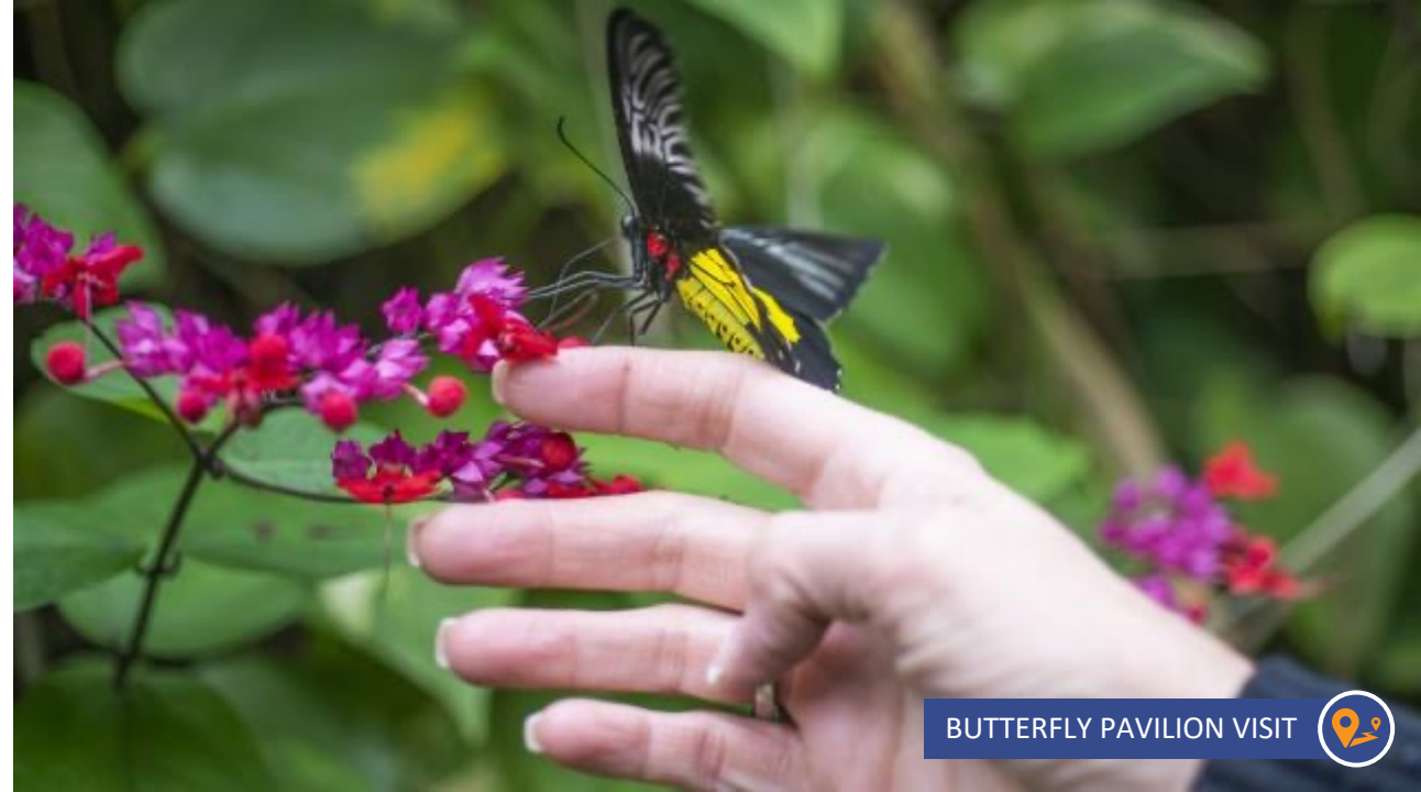
BUTTERFLY PAVILION VISIT