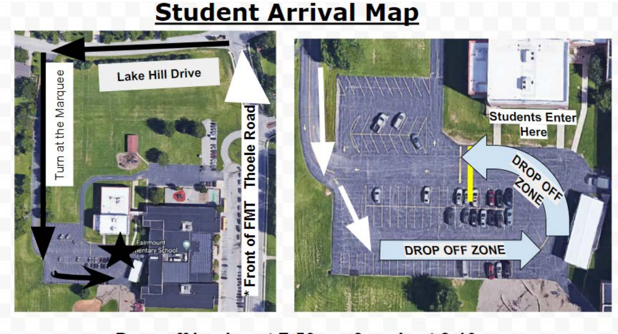
Drop-off begins at 7:50 am & ends at 8:10 am