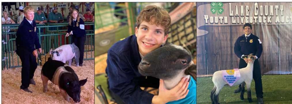
Middle and high school students showing market animals at the 2023 Lane County Fair

Our Chapter is excited about welcoming many new Middle and High School students. Our first meeting will be held at the HS Student Center Monday, September 25 at 6:30 pm. Our Ag program and FFA Chapter started events and activities for middle and high school students the first week of school! We have planned over 20 career development events, multiple field trips and guest speakers, community service projects, and amazing class activities in our district workshops and labs! Thank you to the community and parents for supporting such an active and productive program.