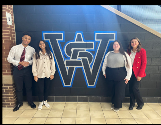
Congratulations to these FCCLA members who will be advancing to the State STAR Events competition!