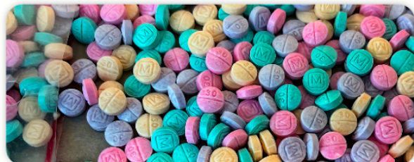
*FAKE rainbow oxycodone M30 tablets containing fentanyl