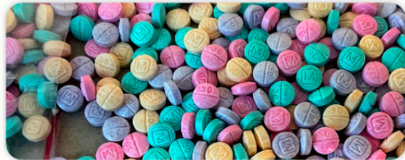
*FAKE rainbow oxycodone M30 tablets containing fentanyl