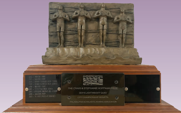
Roman's Crew Team was crowned City Champion in the Varsity Lightweight Quad Division in 2021.