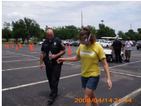
Figure 1 A student walks the line while wearing Fatal Vision Goggles, which simulates impaired vision.

The possession, use and sale of alcohol on the District's campus are governed by the Districts' drug and alcohol policies (found in the MNTC Student Handbook), the Drug-Free School/Workplace Policy (found in the MNTC Staff and Faculty Handbooks) and Oklahoma law. The enforcement of alcohol laws and policies on campus is the primary responsibility of Educational Services and Long Term Programs.