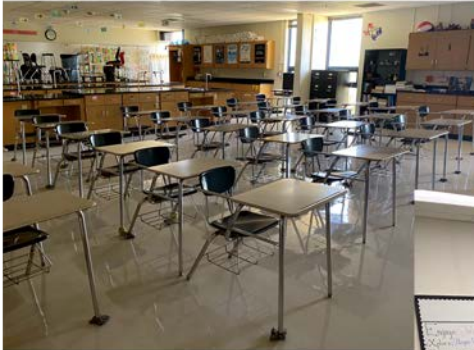
OLD COMBO DESKS