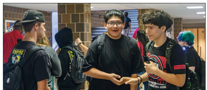
Two friends meet at Winnetonka to find their way to new classes as the bell rings.