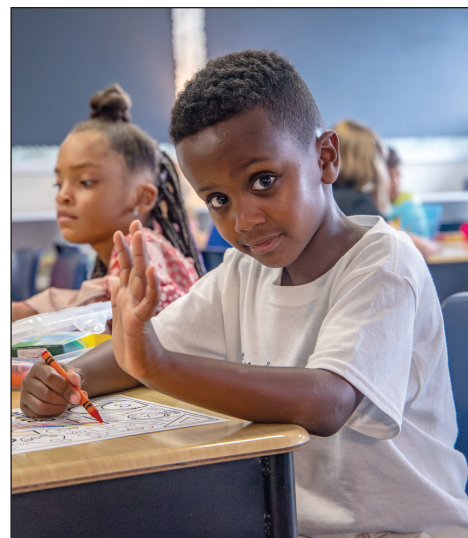
The Stars at Nashua were all smiles and waves on their first day of school.