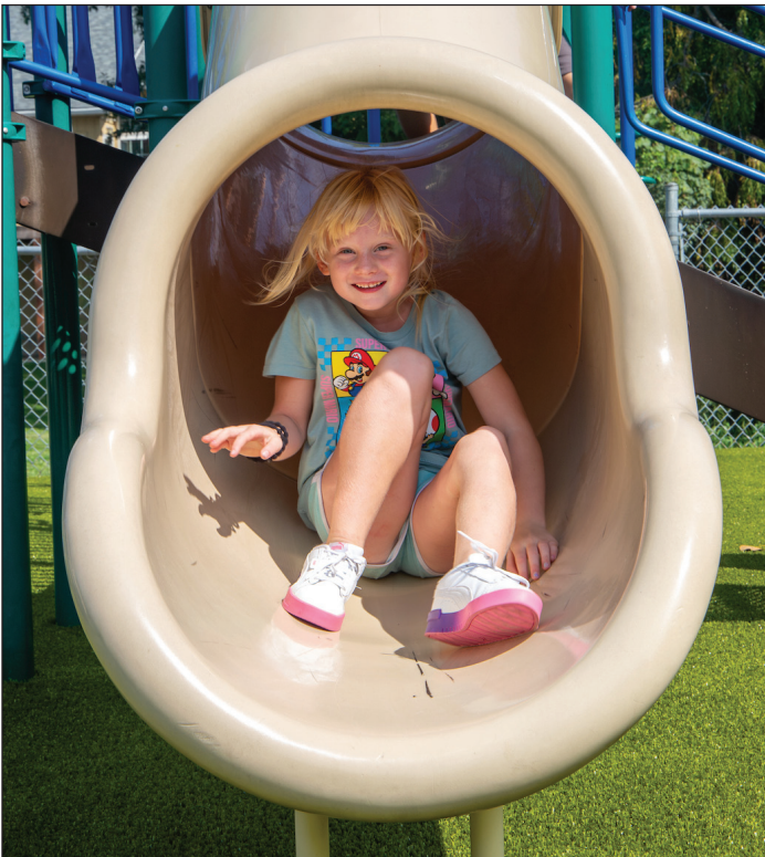
West Englewood students test out new playground equipment on a short break outside.