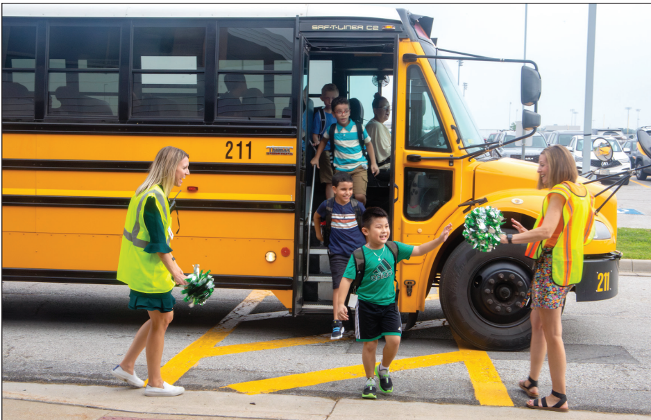
Bell Prairie staff members welcome students back as they arrive on buses for the first day of school.

Tuesday, August 22 was a day full of excitement across NKC Schools as more than 21,500 students returned to classrooms, reconnected with friends and met their new teachers.