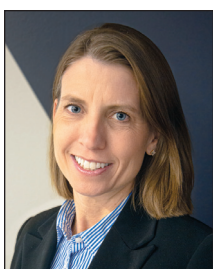
Kate Place Gifted Programs