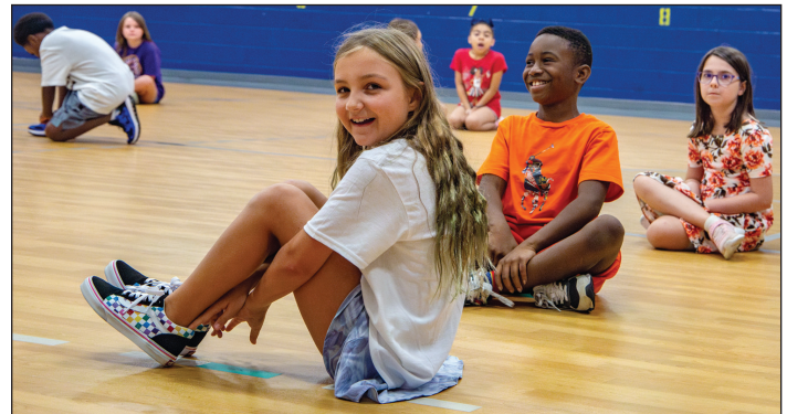
Reunited with friends, Linden West students are ready to get back to gym class.