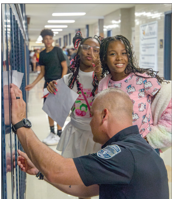
With a little help, students practice opening their lockers for the first time!