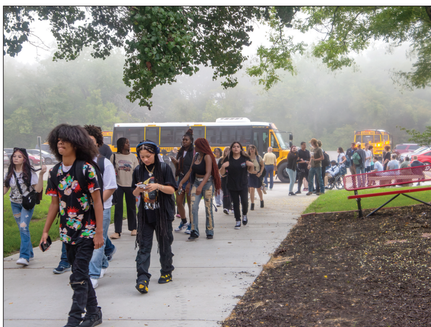
Tonka students stream into the building on August 22, a first day with dense fog and humidity for the record books!