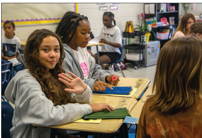
Sixth graders settled in at Eastgate , getting right to learning on their first day as Eagles.