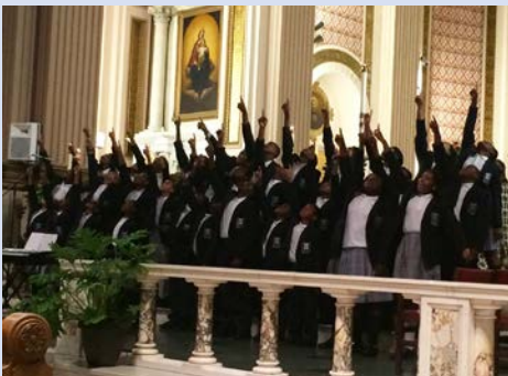
The Gesu Gospel Choir sings in the Revival at The Church of the Gesu. Thank you to the Black Catholic Parishes of the Archdiocese of Philadelphia and the Martin de Porres Foundation for inviting us.

SEPTEMBER Gesu School welcomes Pope Francis to Philadelphia!