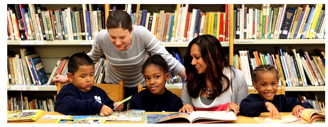
The Junior Board routinely participates in Gesu events, such as Dr. Seuss Day.

n just one year, the Junior Board has made an indelible impact on the Gesu community through service and philanthropy. These dedicated young professionals not only surpassed their fundraising goal, but also cemented solid relationships—from volunteering in the classroom to building corporate partnerships.