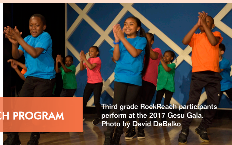
Third grade RockReach participants perform at the 2017 Gesu Gala.