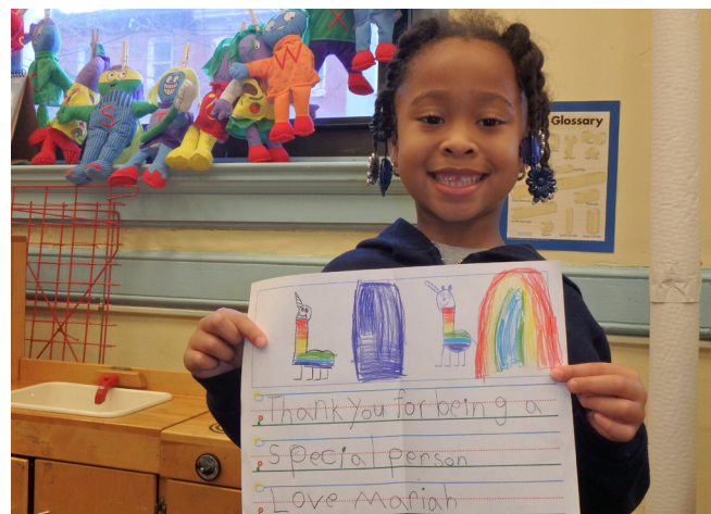
Front Cover Photo: A Gesu School 3 rd grader enjoys reading in our Youth Education for Tomorrow (YET) literacy program, which provides one-to-one attention from a teacher four days per week after school.