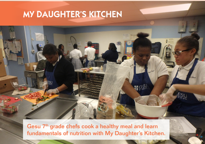
Gesu 7 th grade chefs cook a healthy meal and learn fundamentals of nutrition with My Daughter's Kitchen.