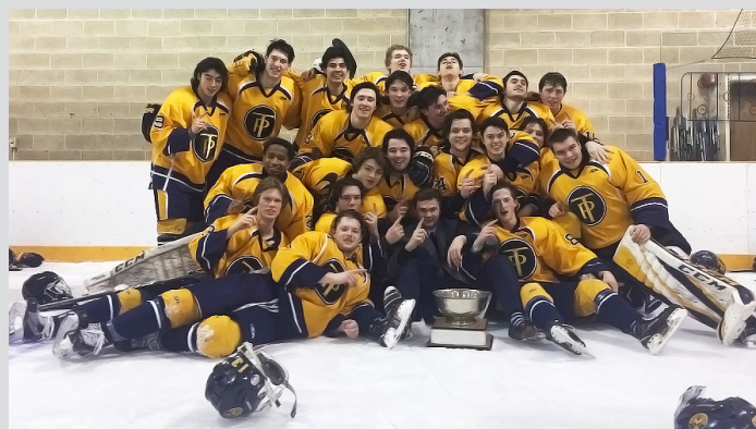
2018 Empire Cup Win