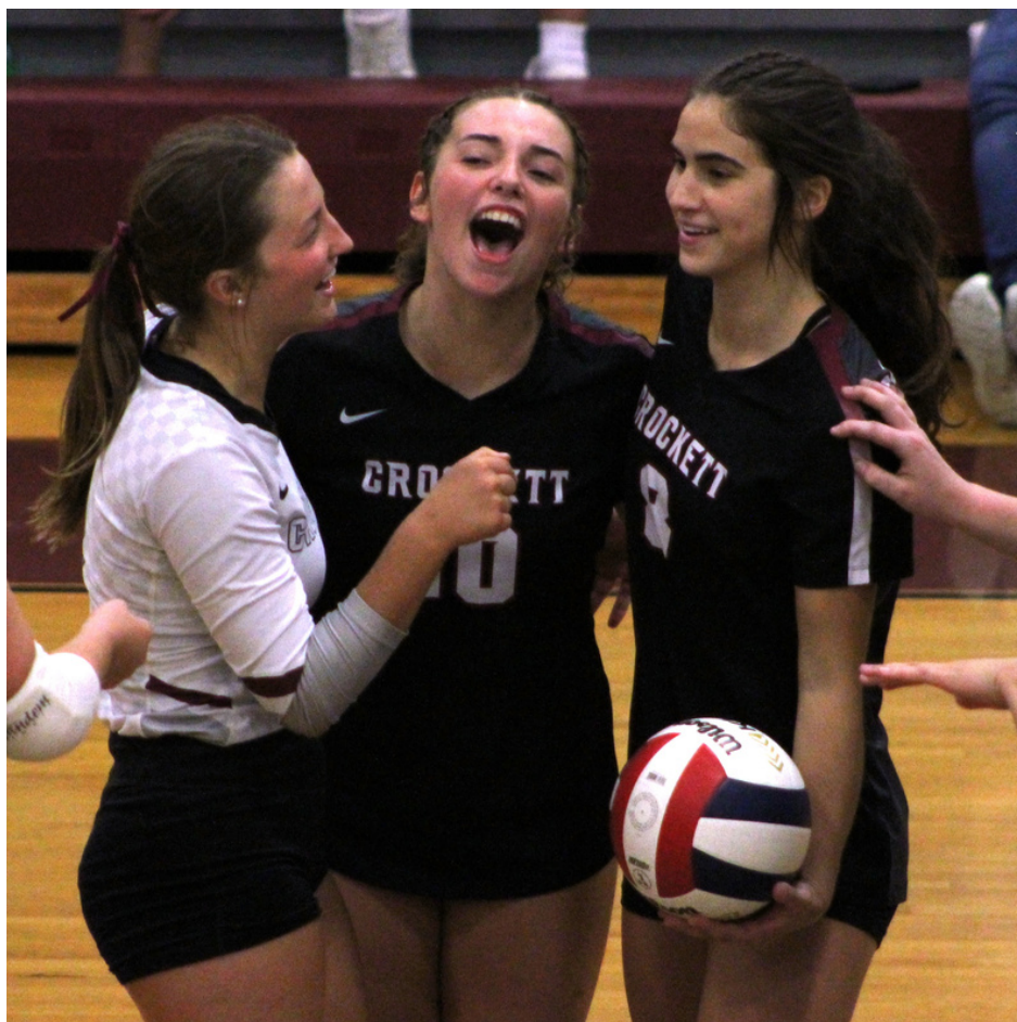
Above: Good things kept happening in Set 4.