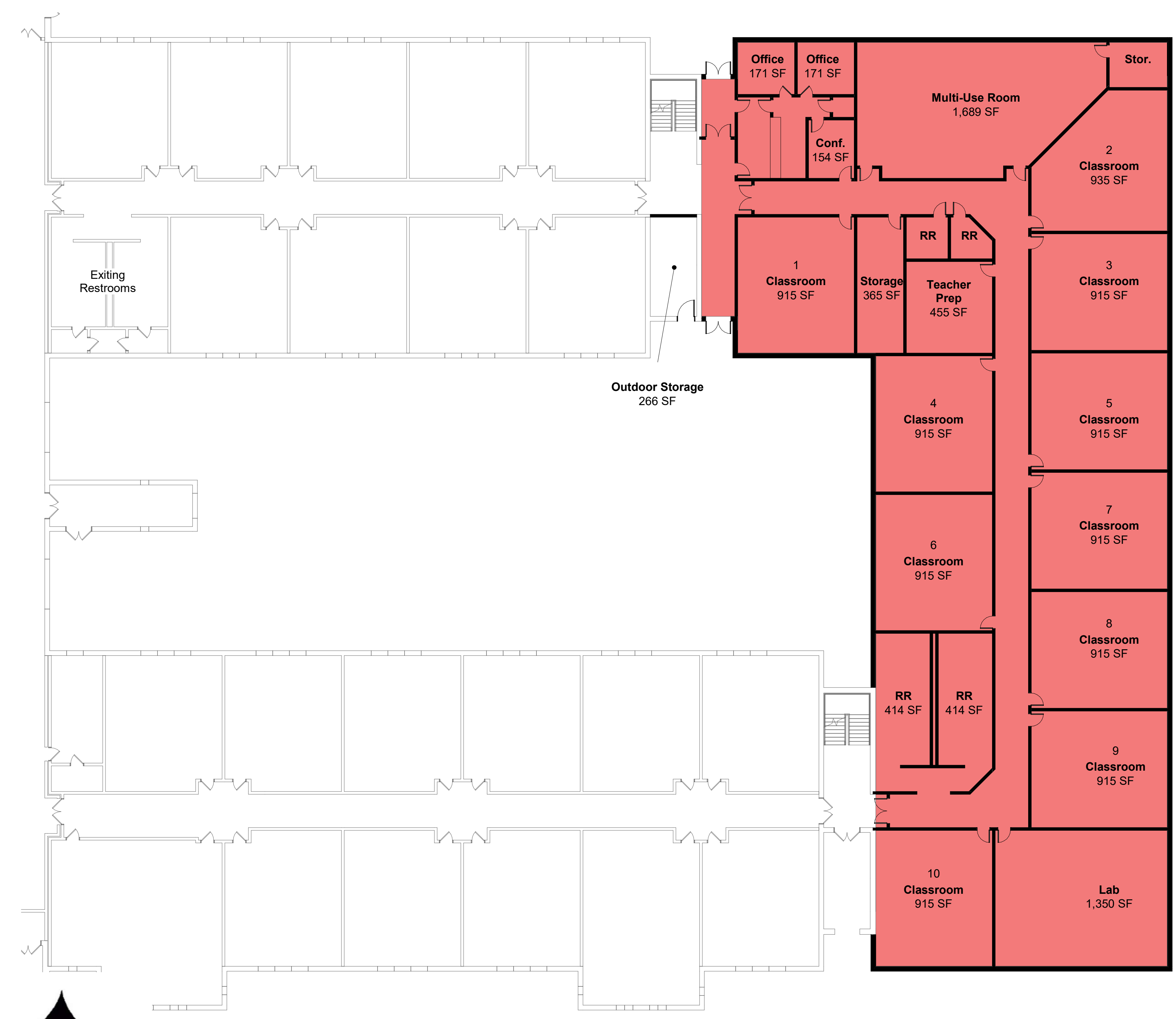
NORTH 3-12 Classroom Addition First Floor Plan 1/16" = 1'-0" 0 8 16 32